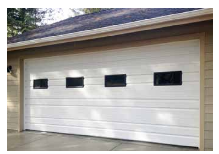
25 gauge in white with 24" x 12" windows