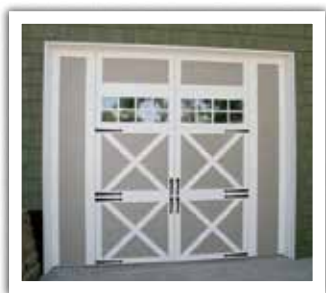
Custom Creation: Shown in Sandstone with Stockton windows