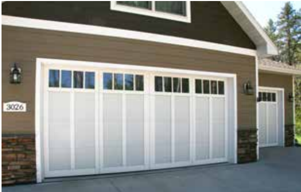
SR-82 in white with stockbridge windows