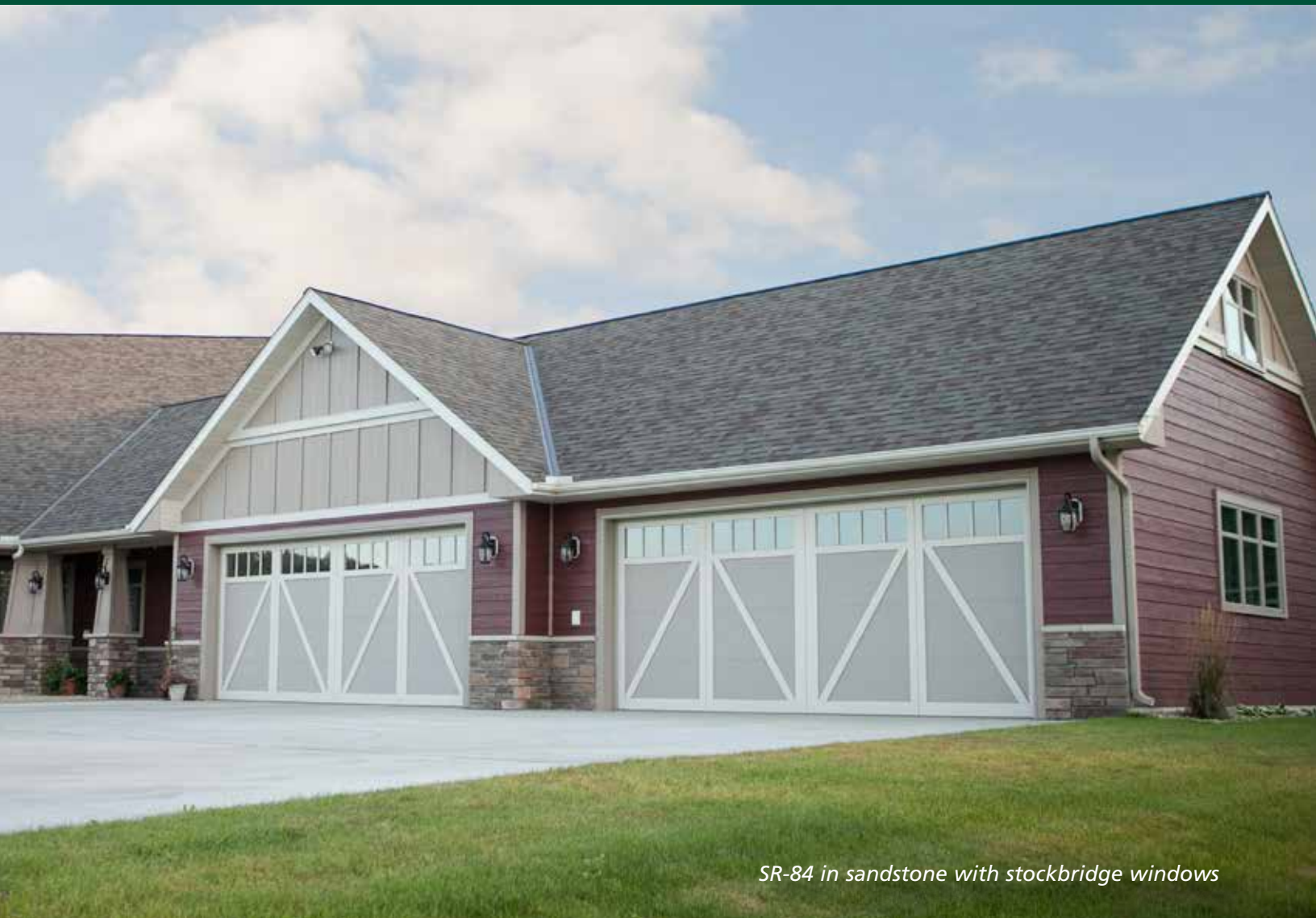
SR-84 in sandstone with stockbridge windows

With classic beauty, durability and thermal efficiency, your home will be The Talk of the Town!