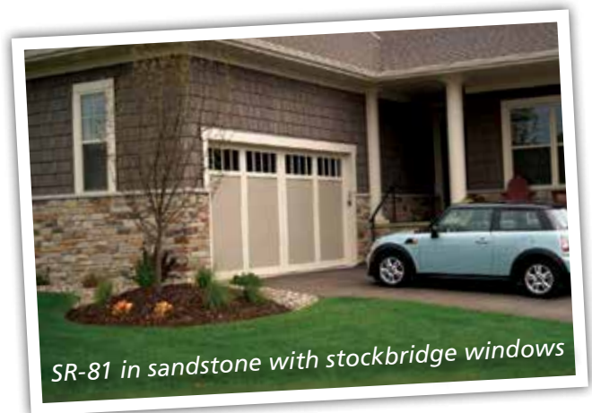
SR-81 in sandstone with stockbridge windows

With six distinctive styles, three classic colors and your choice of windows, you'll be able to create the perfect look to complement your home's architectural style and make it uniquely yours.