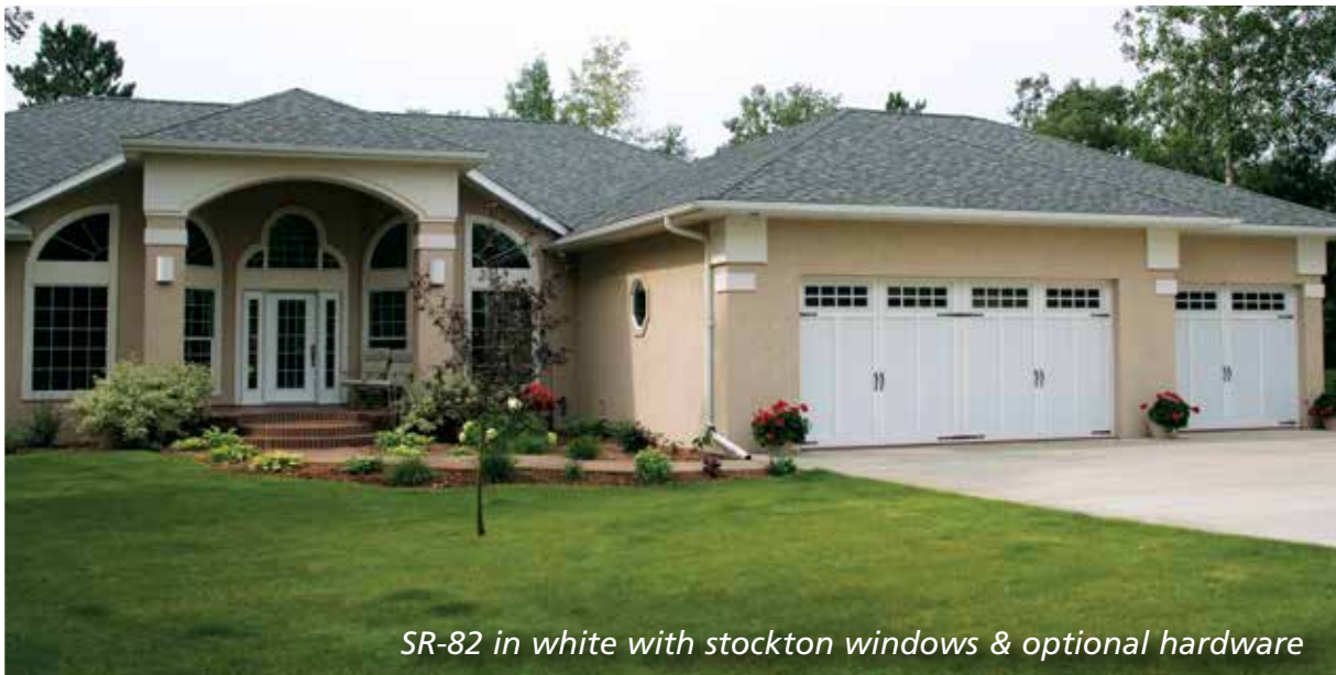
SR-82 in white with stockton windows & optional hardware

Nothing says Welcome Home like our Special Reserve Doors